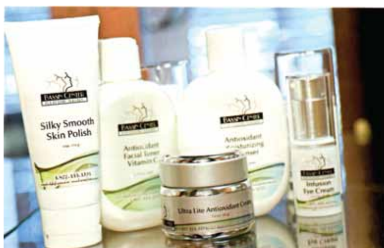
The Bassin Center for Plastic Surgery also offers a line of high-quality products to improve skin and fight aging.