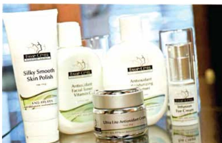
The Bassin Center for Plastic Surgery also offers a line of high-quality products to improve skin and fight aging.